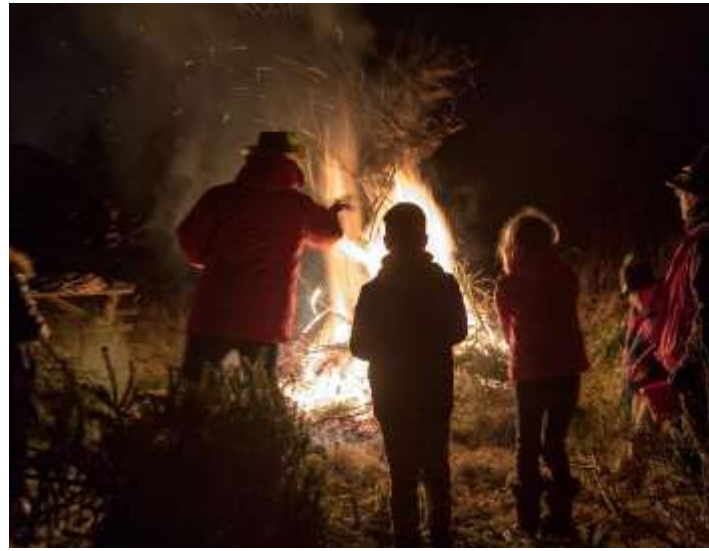
Very dark at the Community Orchard. Trees and people got blessed.