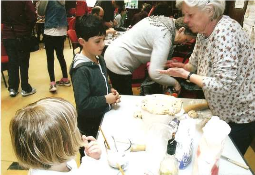
Busy hands made Hot Cross buns at the Good Friday Workshop.

It was wonderful to have so many children and families at this year's Good Friday Workshop. Among many activities, the children made an Easter Garden outside the old West Door of the church, and of course- Hot Cross Buns!