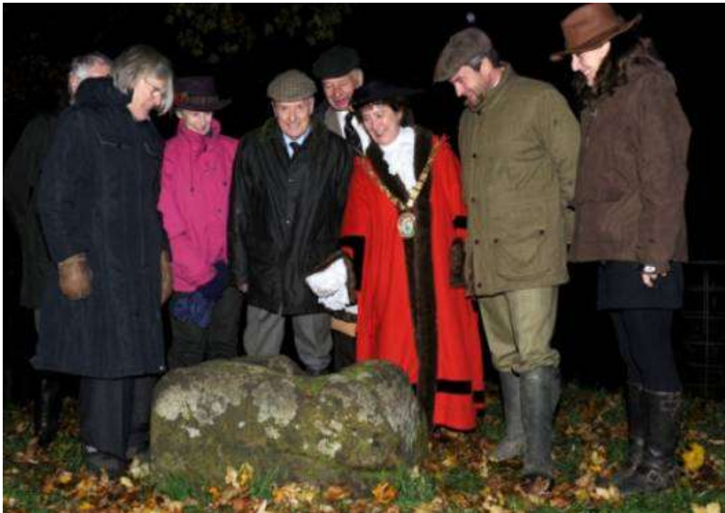
Wroth Silver ceremony 2012

All will then return to The Queens Head for a breakfast and speeches. Please note that breakfast tickets need to be pre-booked directly with the Queens Head, (breakfast cost was £13 in 2014. Included in the price is a glass of rum and hot milk with which to toast the health of His Grace and a churchwarden pipe (tobacco supplied). People will be departing by about 8.45am. Further information on : http://www.wrothsilver.org.uk/