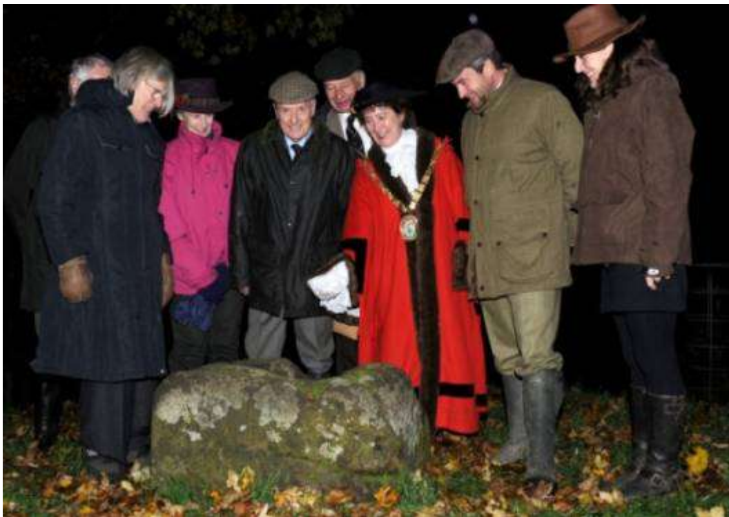
Wroth Silver ceremony 2012

All will then return to The Queens Head for a breakfast and speeches. Please note that breakfast tickets need to be pre-booked directly with the Queens Head, (breakfast cost was £13 in 2014. Included in the price is a glass of rum and hot milk with which to toast the health of His Grace and a churchwarden pipe (tobacco supplied). People will be departing by about 8.45am. Further information on : http://www.wrothsilver.org.uk/