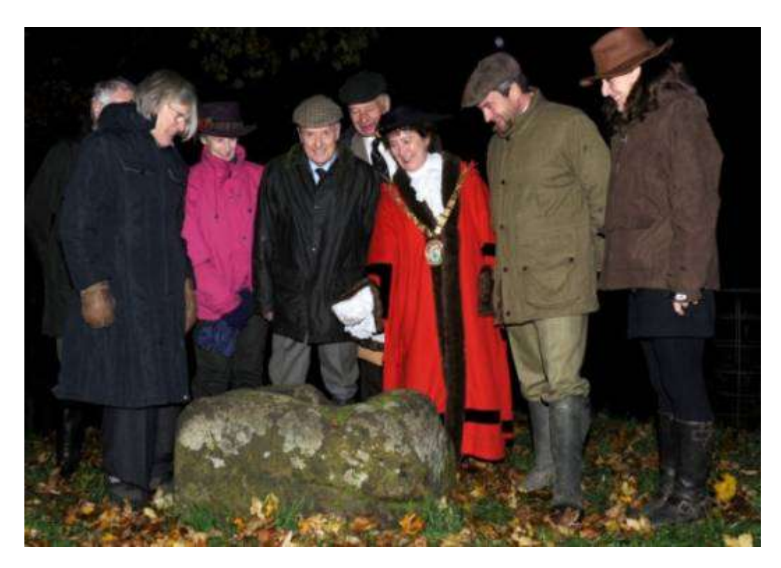
Wroth Silver ceremony 2012

with which to toast the health of His Grace and a churchwarden pipe (tobacco supplied). People will be departing by about 8.45am. Further information on : http://www.wrothsilver.org.uk/