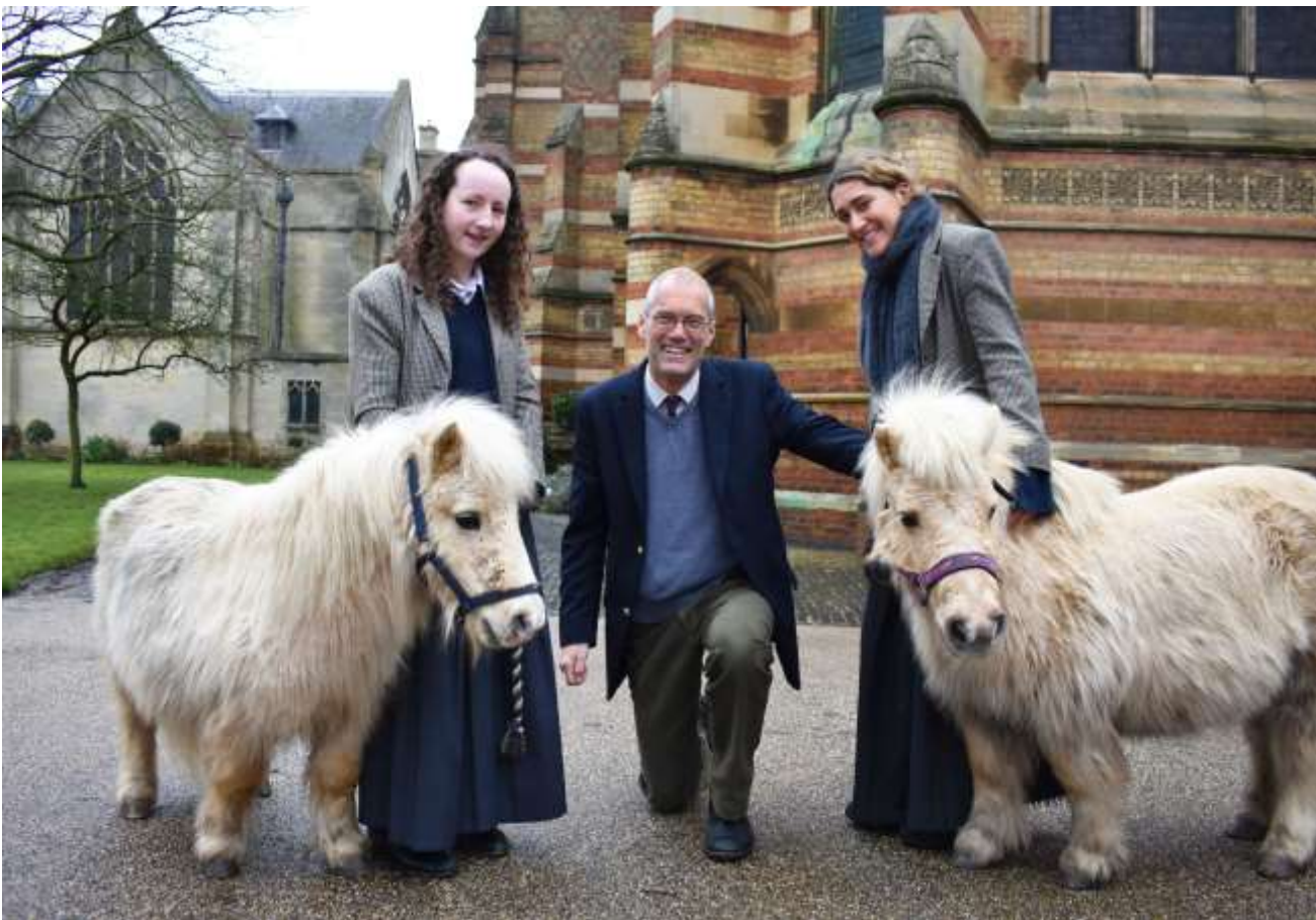
April 2018: Two Shetland ponies from Circles Network, Cawston, trotted up the aisle of Rugby School Chapel to raise awareness of the work of the Circles network.

Please join in our Lent Jars Collection: for Circles network, , an organisation which offers help and support to young people and adults with problems such as bullying and mental health issues. It is very local, based at Cawston near Rugby. Further details on: www.circlesnetwork.org.uk